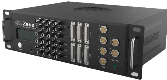
Zeus™ DAQ System

Miniature & Lightweight Headstages (ideal for large & small animals such as non-human primates, birds & mice)