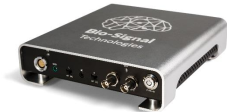
Apollo DAQ System

Miniature & Lightweight Headstages (ideal for large & small animals such as non-human primates, birds & mice)